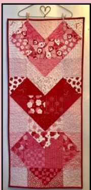
Theresa Chase's wall hanging.