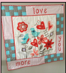
Barb Wrolstad shared this colorful wallhanging.