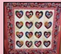
Barb Emery created these sweet quilts.