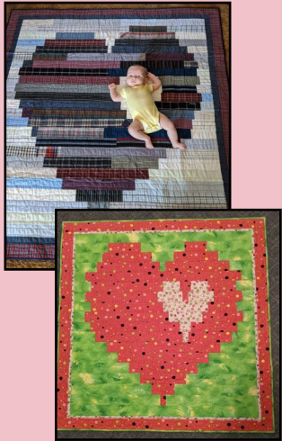
Penny Wolf created these strip heart quilts. Gotta love the little one in the top photo!