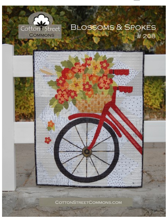
QUILT SIZE 30" X 36"

"Blossoms & Spokes" is a beautiful pieced wall hanging that also uses collage and applique. Supply list will be mailed in early January. This delightful class will be taught by Melinda Snell.