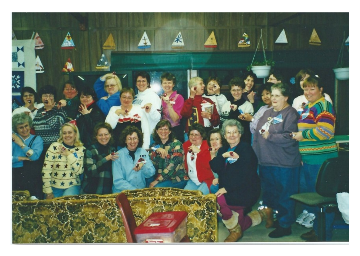
1st annual Frozen Fabric Frolic, 2001

Plan to attend the 20<sup>th</sup> Annual Frozen Fabric Frolic February 21-23, 2020 All sewing and meals will be in the beautiful new Fellowship Center, Camp of the Cross, Garrison ND