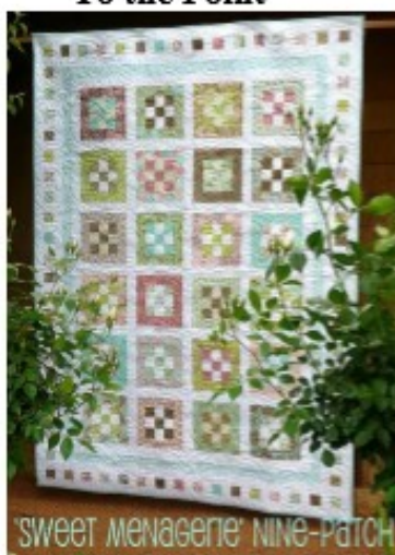
Sweet Menagerie Nine-Patch