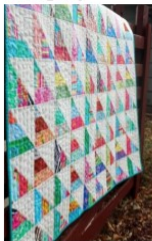
To the Point