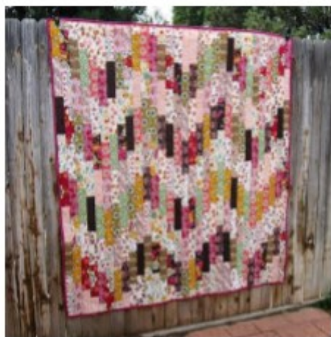
Playing the Scales