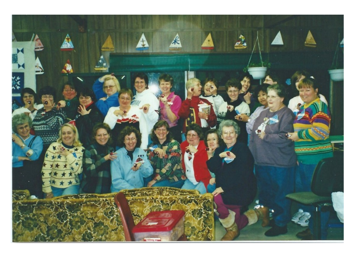
1st annual Frozen Fabric Frolic, 2001

Plan to attend the 20<sup>th</sup> Annual Frozen Fabric Frolic February 21-23, 2020 All sewing and meals will be in the beautiful new Fellowship Center, Camp of the Cross, Garrison ND