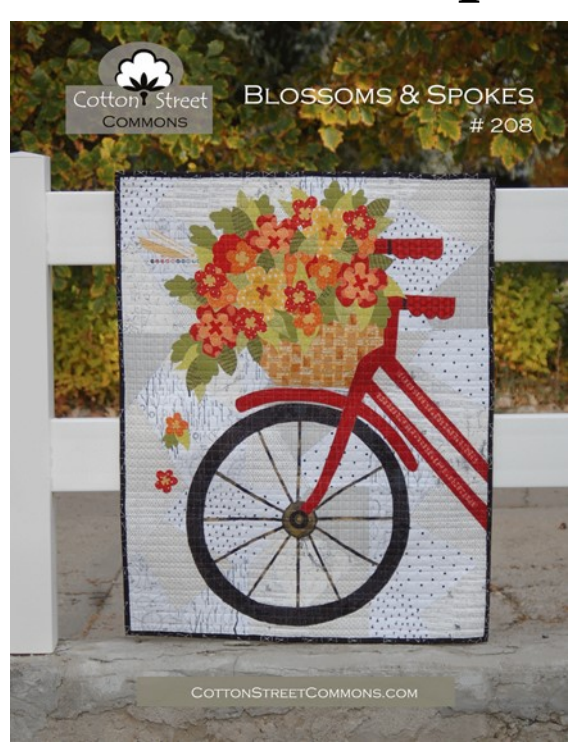
QUILT SIZE 30" X 36"

"Blossoms & Spokes" is a beautiful pieced wall hanging that also uses collage and applique. Supply list will be mailed in early January. This delightful class will be taught by Melinda Snell.