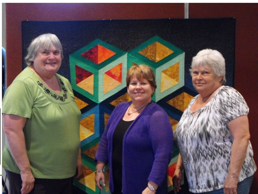
New friends from Baker, Montana Oh... did I mention they own a quilt store too!